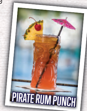
PIRATE RUM PUNCH

Made with Parton Reposado Tequila, Fresh Lime Juice, Real Blue Agave Nectar and a Splash of Orange Juice or Try a Smokey Skinny made with Vita Mezcal 12.99