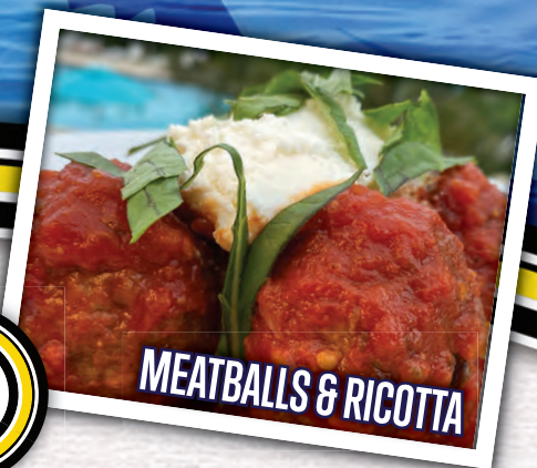
MEATBALLS & RICOTTA