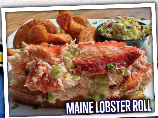
MAINE LOBSTER ROLL

Portobello Mushroom, Spinach, Roasted Peppers and Sweet Onions Drizzled with Balsamic Reduction Sauce Served on a Potato Bun with Smoked Gouda 15.99