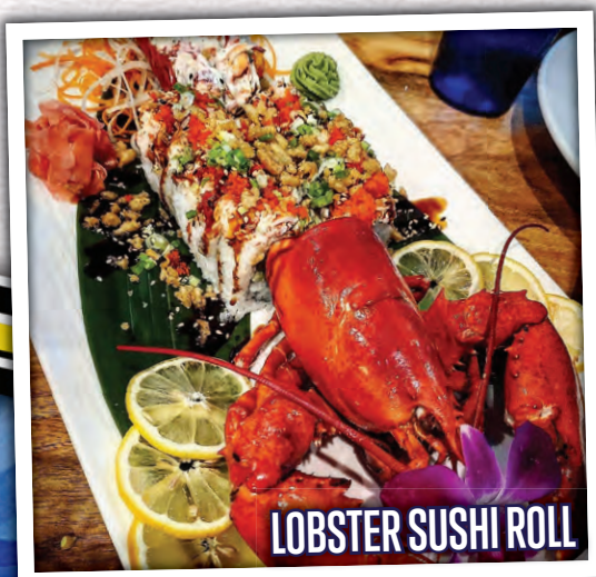
LOBSTER SUSHI ROLL

Chef's Choice (Serves 3) 92.99 8 Pieces Sushi, 10 Pieces Sashimi and 3 Rolls